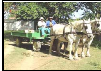
Horses in Wagon

They are groomed before and after work and have their feet inspected daily and picked, filed and oiled as required. They are inoculated for horse sickness and tetanus each year and are dipped once every two weeks in summer and once a month in winter.