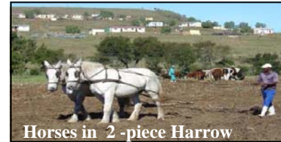
Horses in 2-piece Harrow