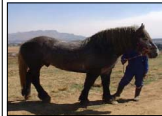
Herd Stallion 'Maloti'

three months prior to foaling. This set us to wondering whether Maloti might be the problem, as he had been observed on occasion that year trying to mount the mares when they were at an advanced stage of their pregnancy and we had learned that it is not uncommon for pregnant mares to give off scent which encourages the stallion to mount them with possible abortion or premature birthing results. In 2009 we took all the mares away from Maloti three months before they were due to foal. The result was two healthy foals, Shaka a colt and Vuyakazi a filly born to Sally and Tombi respectively. Somikazi again aborted her foal and we suspect that this was because she had been inadvertently mated much earlier the previous year and as a result was much further advanced than we thought and may have been mounted by Maloti before we put them apart. She aborted two weeks after we separated them. We are hoping that we have found the problem and our modus