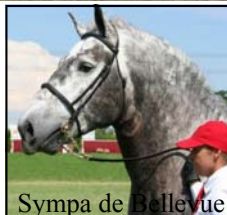
Sympa de Bellevue