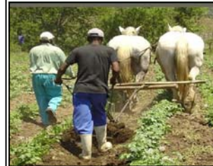
Horses Ridging Potatoes