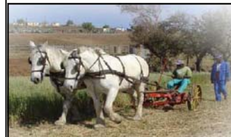
Mowing with Horses