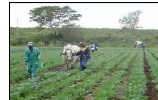
Horses Weeding Cabbages